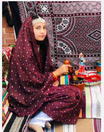
CULTURAL EVENT was celebrated to enhance the nation's culture in our students, was held with success on March 19, 2021.